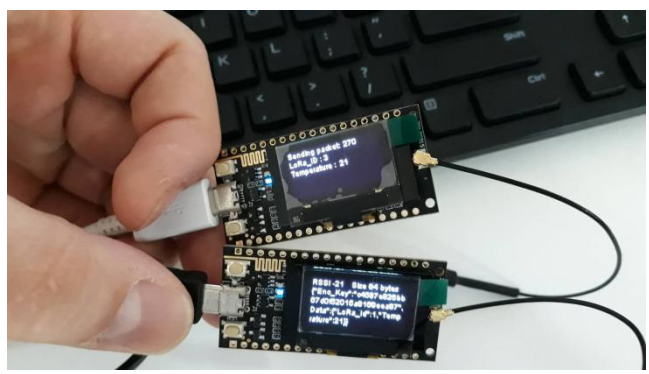
Fig. 2. LoRa devices used in the development

The IoT devices/nodes (Fig. 2) are equipped with SX1278 chip which is based on ESP32 for frequency of 433 MHz. The nodes have 16 MB on board flash memory and 0.96-inch blue OLED display, lithium battery, charging circuit, and highly-integrated CP2102 USB-to-UART bridge controller providing a simple solution for updating RS-232 designs to USB using a minimum components and PCB space. The CP2102 includes a USB 2.0 full-speed function controller, USB transceiver, oscillator, EEPROM, and asynchronous serial data bus (UART) with full modem control signals in a compact 5 x 5 mm MLP-28 package.