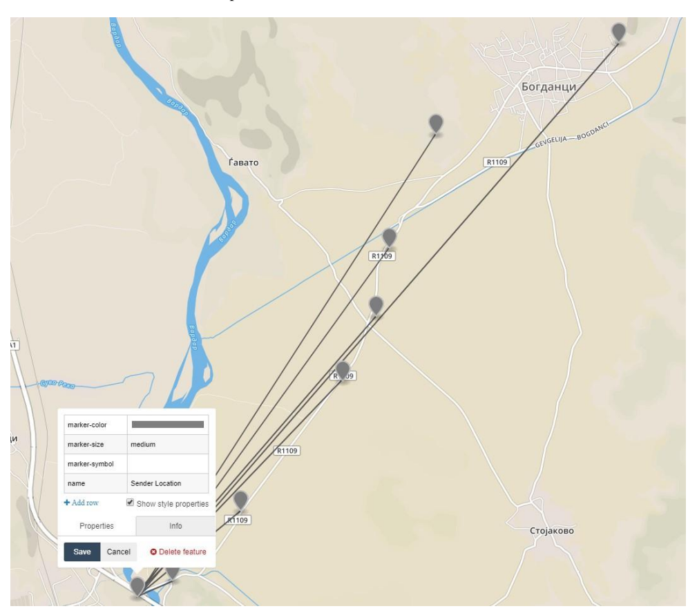
Fig. 3. Test results from non-urban environment

The IoT devices/nodes (Fig. 2) are equipped with SX1278 chip which is based on ESP32 for frequency of 433 MHz. The nodes have 16 MB on board flash memory and 0.96-inch blue OLED display, lithium battery, charging circuit, and highly-integrated CP2102 USB-to-UART bridge controller providing a simple solution for updating RS-232 designs to USB using a minimum components and PCB space. The CP2102 includes a USB 2.0 full-speed function controller, USB transceiver, oscillator, EEPROM, and asynchronous serial data bus (UART) with full modem control signals in a compact 5 x 5 mm MLP-28 package.