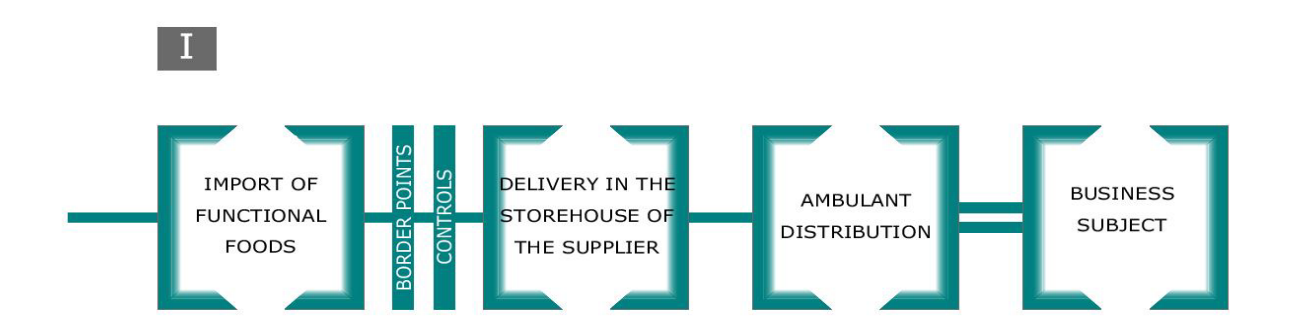
Figure 1: The imported supplies in Kosovo's internal market.

Functional food such as dairies come into Kosovo's internal market as imported from different places of European Union, these places are obliged to fulfill some criteria regarding the quality in accordance with the law for safe food in Kosovo. The imported supplies of internal market, has written ruled that should be fulfilled by every distributor, supplier or business that wants to operate with foods. The supplying of functional food in the internal market is realized as follows: starting from the border lines- The delivery of the foods inside Kosovo's territory, then in the distributors' storehouses, the delivery in accordance with the businesses, the delivery for the businesses (supermarkets), the delivery into the businesses' storehouses, and lastly positioning for the sales' shelves.