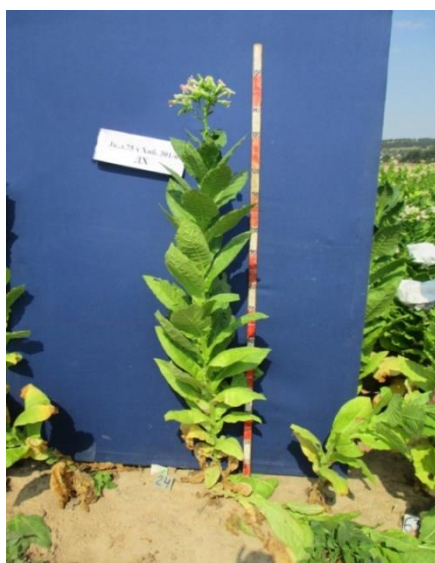
Figure 7.Jk.1.75-301 DH