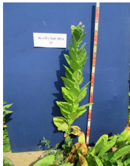
Figure 6.Жк.л.75-301 Ø