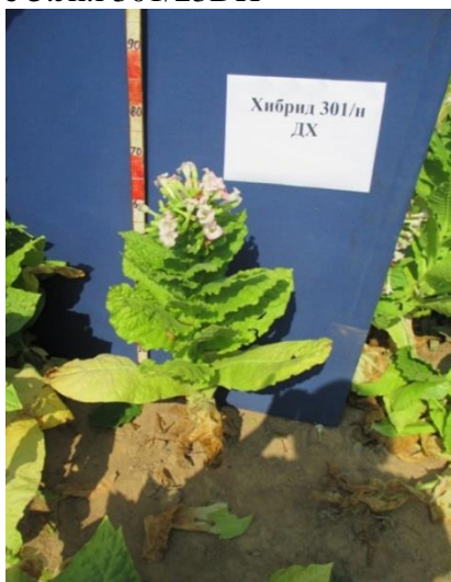
Figure 5.Хибрид 301/п DH