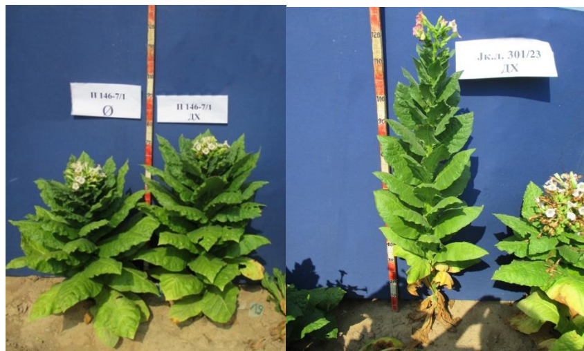
Figure 1. P 146-7/1 Ø and P 146-7/1 DH Figure 2. Jk.l. 301/23 Ø

The analyses of the physical properties were performed in the accredited laboratory of the Scientific Tobacco Institute, in accordance with the standard MKS EN ISO/IEC 17025: 2006, pursuant to recognized standard methods. The following physical properties were examined: materiality, thickness, and content of the main (mid) rib of the leaves.