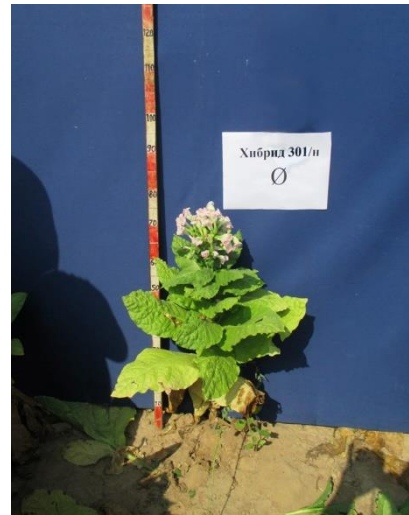
Figure 4.Хибрид 301/п Ø