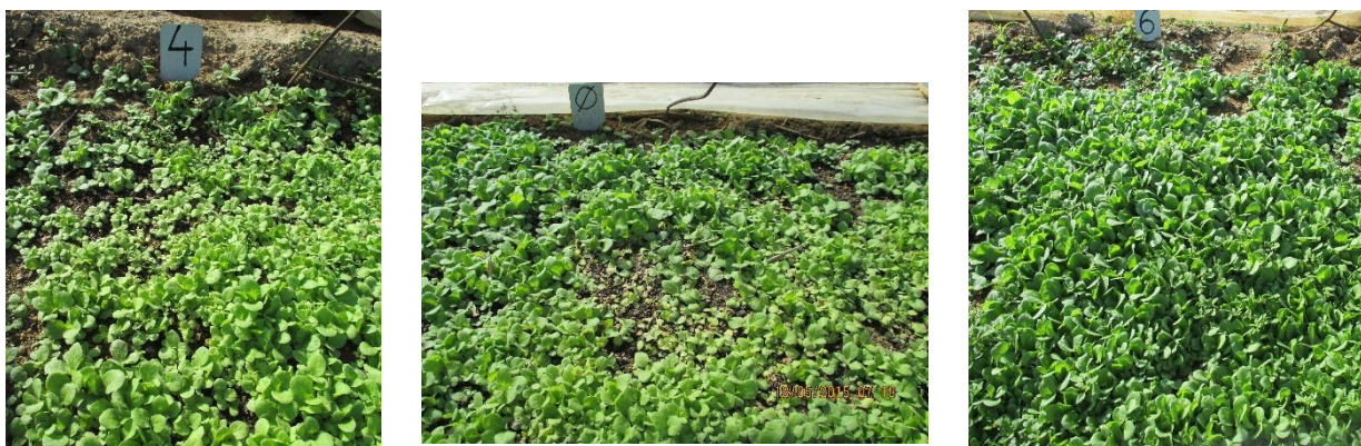
Figures 5-7. Variants in seedbeds test

The values for disease intensity were also lower in variants where the preparation was applied in soil, compared to the check and the variants treated after 15 days (Table 4, Figures 5-7).