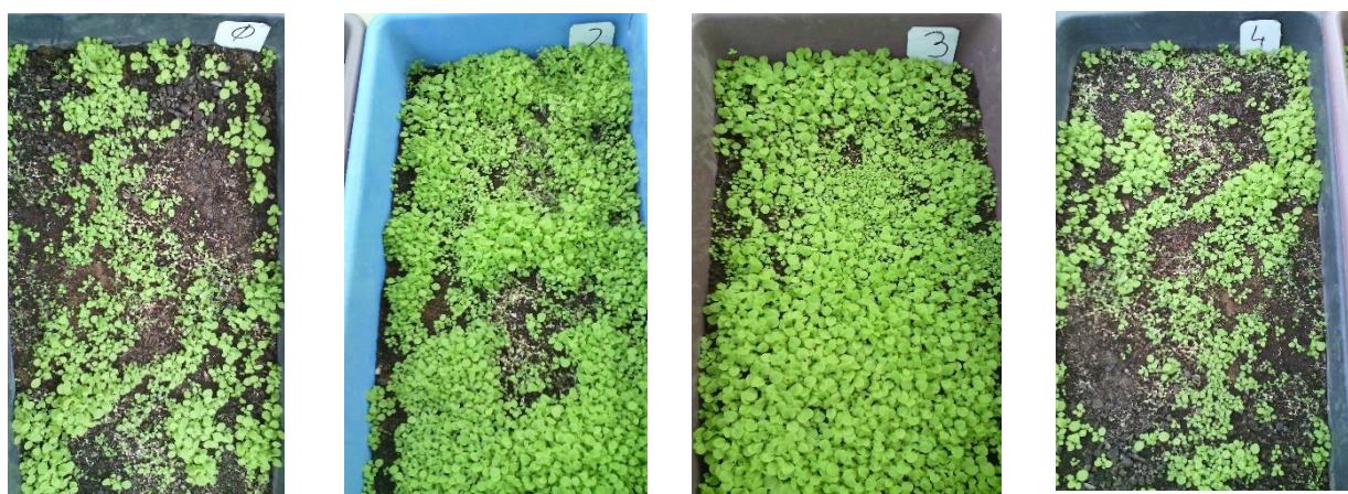
Figures 1-4. Variants in biolaboratory test

(3.93%). Delayed treatment of seedlings did not produce good results (20.15%). The same situation was observed in Variant 4, when the preparation was applied in infested soil. Results obtained for the variants in biolaboratory test are presented in Figures 1-4.