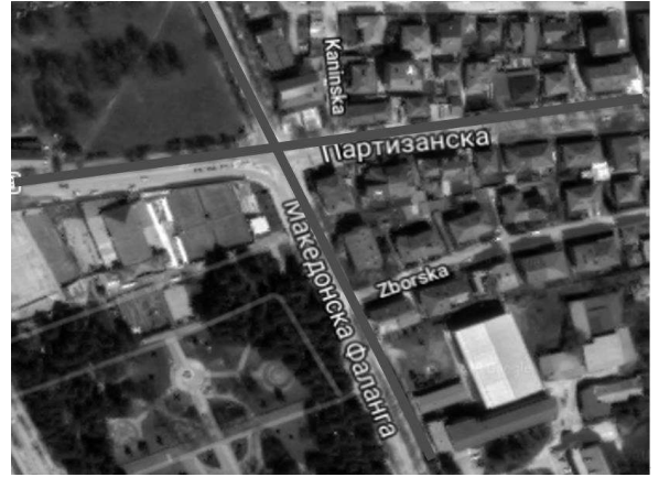
Fig. 4. Intersection design

The testing and evaluation of the proposed adaptive system will be performed on a highly polluted, isolated urban intersection. The chosen intersection is located in the wider urban area of the city of Bitola, North Macedonia, as displayed in Fig. 4. To collect research data for the evaluation of the proposed ATSC, the following field data will be measured using the produced sensor from results described in [5]: a) geometric elements of the chosen intersection, and b) vehicle volume and data from the magnetic sensor capable of classifying vehicles and sensor/integrated air quality monitoring station for measuring vehicle emissions.