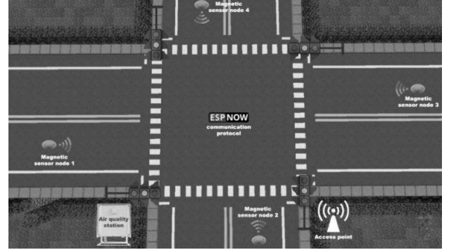
Fig. 1. The procedure and communication protocol for data collection

accuracy classification of vehicles. Vehicle sensing/counting and vehicle classification data followed with real-time data from an air quality monitoring station implemented on a four-leg signalized intersection are real input data for the proposed fuzzy-based ATSC.