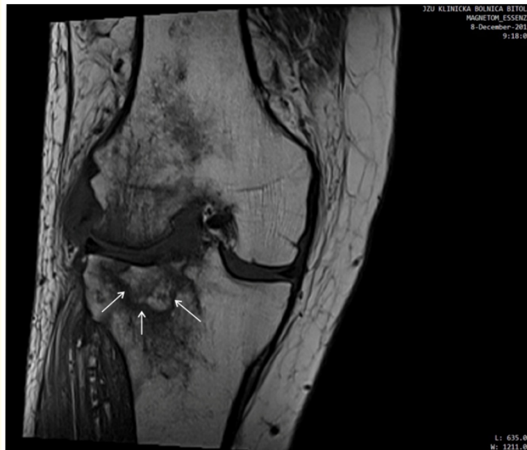
Figure 2: MRI coronal plane scan of the tibia 19 days after the time of the initial injury.

with symptomatic therapy, cold compresses analgesics and non-steroidal antirheumatics. Due to the further deterioration of the general condition with knee swelling, the patient called for a repeat orthopedic examination on 6 th December 2019 and he was directed to MRI.