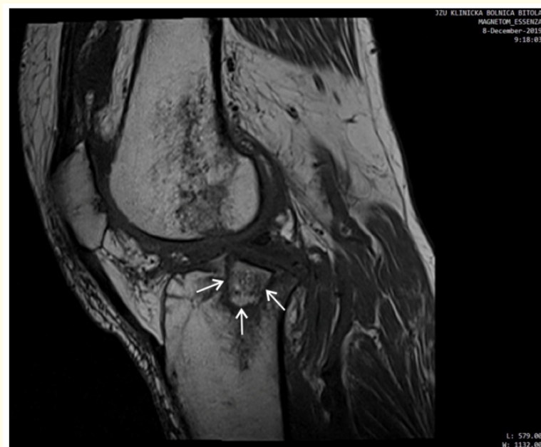
Figure 3: MRI sagittal plane scan of the tibia 19 days after the time of the initial injury.

MRI was acquired at 8 th December 2019. Figure 2 show MRI image of the tibial plateau of the proximal tibia in the coronal plane. The image was acquired by standard pulse sequences and standard planes. We follow the plateau fracture accompanied by depression of lateral tibial condyle and intraarticular fluid with MRI characteristics of hemarthrosis (bleeding into joint spaces). The orthopedist after the results of MRI evacuated a bloody content from the swollen knee.