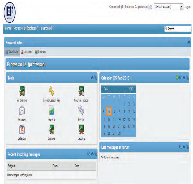
Fig. 3. Screen of the professor dashboard

LMS system that is used for enrichment of the teaching subjects in the field of programming can promote the learning of the subjects because of the possibility of students to focus on solving the issues and get help from the system and from the professor.