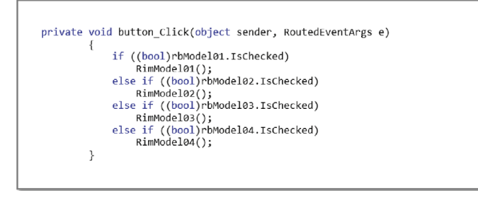
Figure 3. Functions that check selected model.

When the user chooses the required parameters and selects the Create Model button, the code calls a function that checks which of the models is selected and depending on the model, the corresponding function for its creation in SolidWorks is called, as shown in Fig. 3.