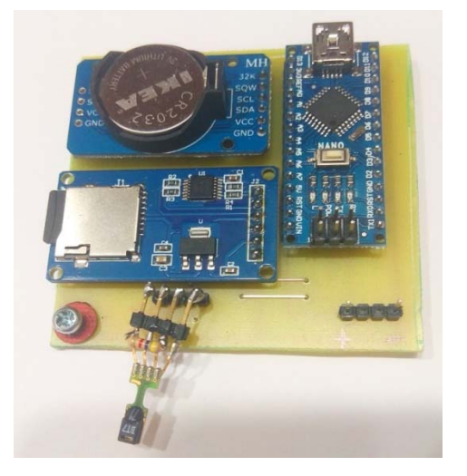
Fig. 2. Temperature and humiditysensor - inside the box