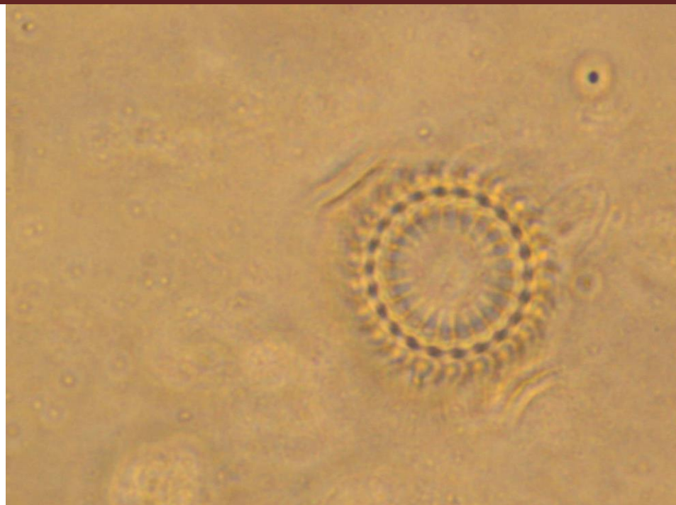
Fig.3 Trichodina sp. on gills of common carp ( Cyprinus carpio , L. 1758) (original)