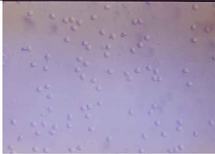
Fig.1. Myxobolus müelleri on fins of common carp ( Cyprinus carpio , L. 1758) (original)