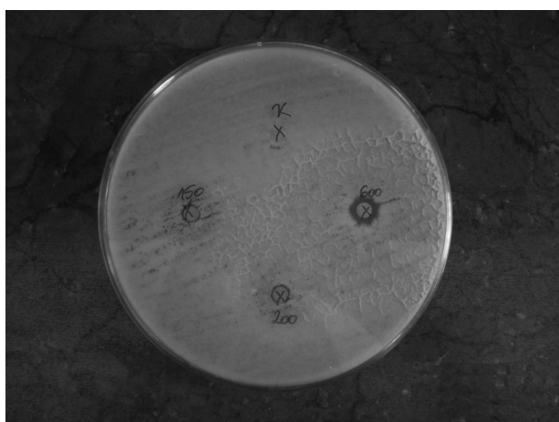
Figure 4. Inhibition zones on Aspergillus niger formed by Satureja hortensis L. essential oil in concentrations of 150, 200 and 600 mg/mL