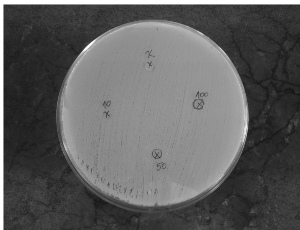
Figure 2. Inhibition zones on Candida albicans formed by Satureja hortensis L. essential oil in concentrations of 10, 50 and 100 mg/mL