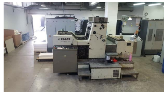
Fig1. KBA Rapid 72 offset machine and Adast Dominant 816 monochrome offset machine

The measurement of internal and external temperature are given in the following tables.