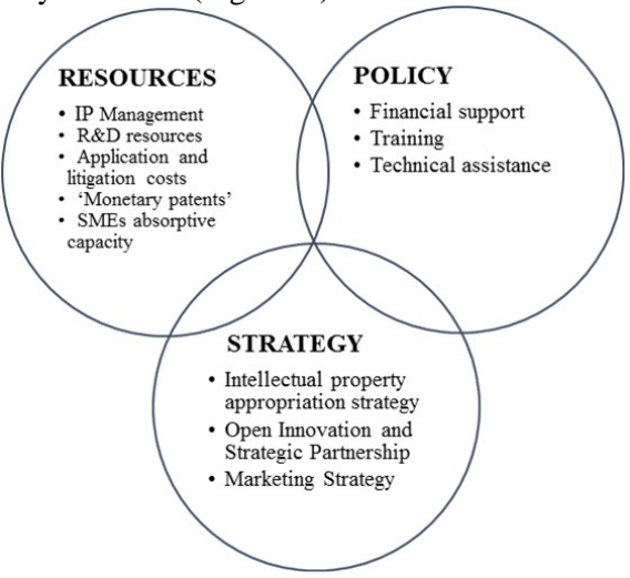
Figure 1. The factors affecting SMEs patent activities

The patent activities of SMEs have to be analyzed in the context of a complex interaction among various factors. With respect to this, we focus our analysis primarily on the following factors: the available resources of SMEs, the strategies for innovation and IPR development and, the impact of policy measures (Figure 1.).