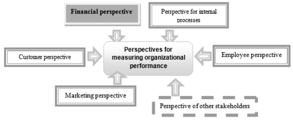
Figure 2: Selected perspectives for measuring organizational performance in the system for measuring organizational performance