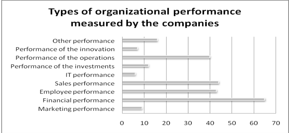
Graph 1: Types of organizational performance measured by the companies of the food industry in the Republic of Macedonia