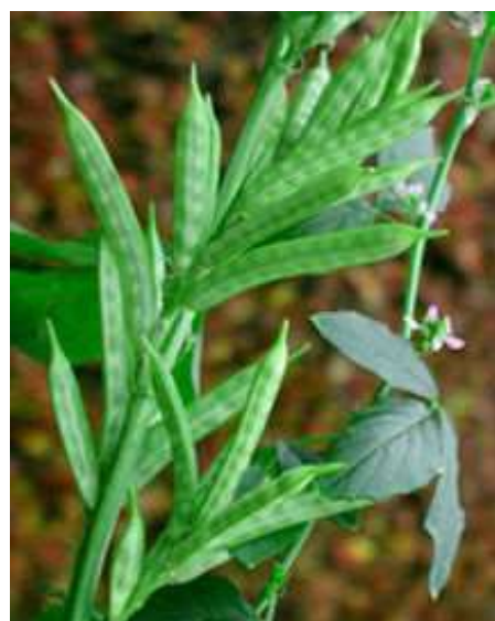
Fig-1: Guar Cyamopsis tetragonoloba

Guar Gum or guaran is extracting from endosperm of Cyamopsis tetragonoloba (figure 1) and C. psoraloides [1]. Guar plant belongs to family Fabaceae or Leguminaceae . Common name, is guar, from "sankrist word" "go" or "gav". Guar bean contains a large endosperm rich in galactomannan, a gel forming agent in water. As depicting in figure 1 Guar gum is composed of chain (1→4)-linked β-D mannopyranosyl units substituted at O-6 by single-unit side-chains of α-D-galactopyranose (figure 3) [2]. The germ and hull of the guar seeds are called Guar meal, which is rich in protein. Figure 2 depicts different part of Guar seed.