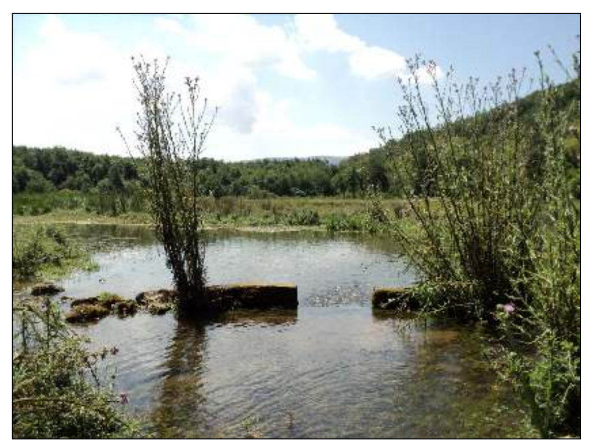
Figure 2: Belčišta wetland – landscape.

Acanthocephala (spiny-headed worms or thorn-headed worms) are necrotrophic worms that live as adults exclusively within the small intestines. They have a retractable proboscis armed with spines that is inserted into the mucosa as a holdfast. They have separate sexes and a lack of circulatory, respiratory, and digestive systems.