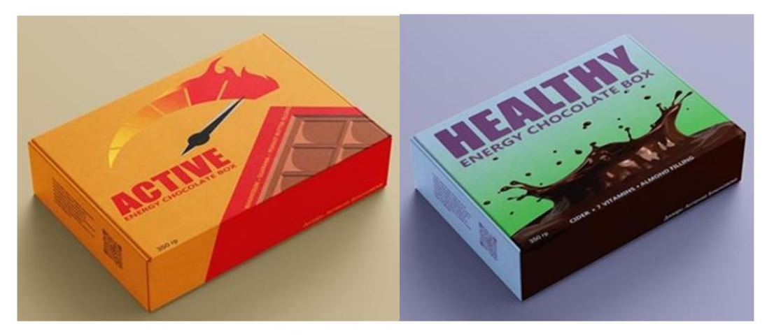
Figure 2. Product packaging