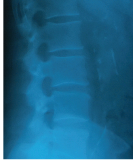
An example AAC-9 score (40 year male, HD duration 9 year)

(ii) For the CHP group: BMD: 0.729 \pm 0.147 (g/cm 2 ), range (0.388–1.224); 0.865 \pm 0.172 (g/cm 2 ), range (0.368–1.484); 0.800 \pm 0.14 (g/cm 2 ), range (0.378–1.354). DEXA scoring: -1.86 \pm 0.9 , range [(-2.8)–(+0.5)]; -0.75 \pm 0.98 , range [(-2.8)–(+2.0)];