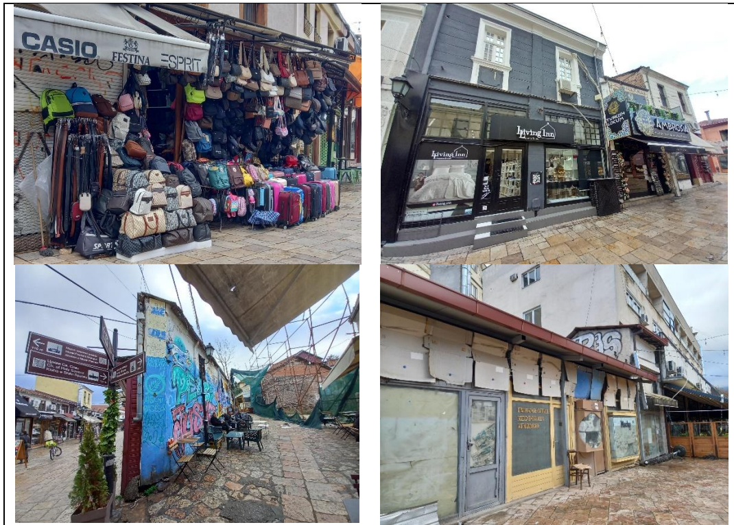
Fig. 3: Current outlook of the Old Bazaar

Contrasting Fig. 3 (current outlook) with Fig. 4 (past outlook) highlights that the Old Bazaar is under significant stress in terms of socio-cultural and aesthetic pressure. Local supply-enablers prioritize the economic benefits of tourism over concerns about socio-cultural and environmental damage. This prioritization of economic advantages over the preservation of the cultural identity of the Old Bazaar raises the question of re-evaluating the current monitoring system for safeguarding cultural heritage.