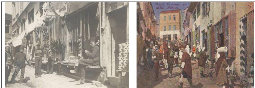
Fig. 4: Past outlook of the Old Bazaar

Contrasting Fig. 3 (current outlook) with Fig. 4 (past outlook) highlights that the Old Bazaar is under significant stress in terms of socio-cultural and aesthetic pressure. Local supply-enablers prioritize the economic benefits of tourism over concerns about socio-cultural and environmental damage. This prioritization of economic advantages over the preservation of the cultural identity of the Old Bazaar raises the question of re-evaluating the current monitoring system for safeguarding cultural heritage.