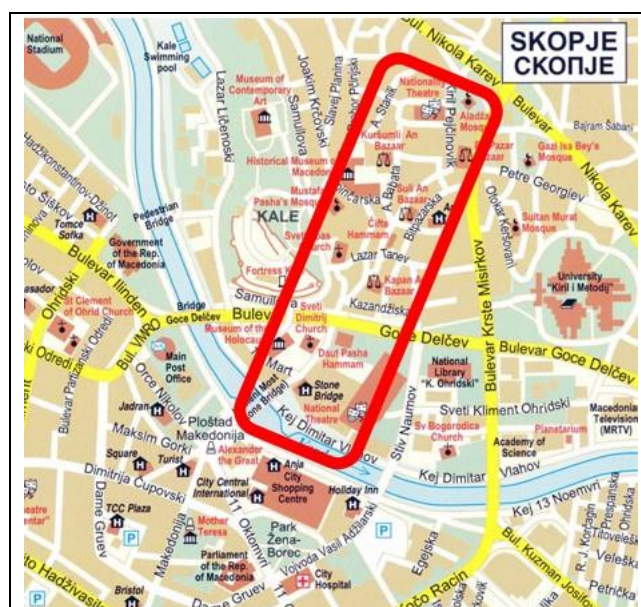
Fig. 1: Location of the Old Bazaar in the city core of Skopje, North Macedonia