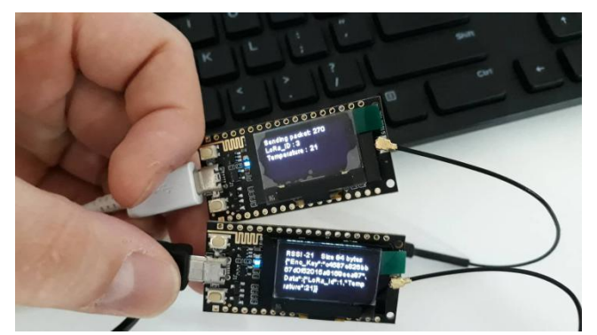
Fig. 2. LoRa devices used in the development

The IoT devices/nodes (Fig. 2) are equipped with SX1278 chip which is based on ESP32 for frequency of 433 MHz. The nodes have 16 MB on board flash memory and 0.96-inch blue OLED display, lithium battery, charging circuit, and highly-integrated CP2102 USB-to-UART bridge controller providing a simple solution for updating RS-232 designs to USB using a minimum components and PCB space. The CP2102 includes a USB 2.0 full-speed function controller, USB transceiver, oscillator, EEPROM, and asynchronous serial data bus (UART) with full modem control signals in a compact 5 x 5 mm MLP-28 package.