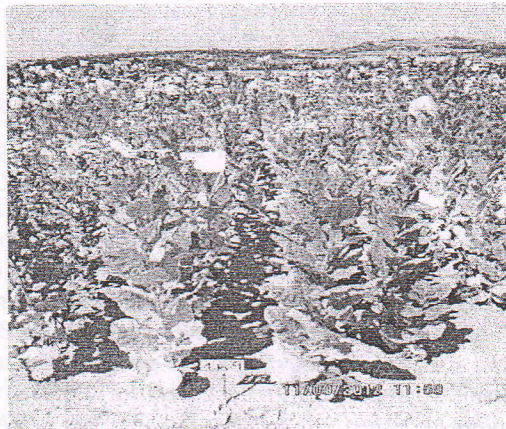
Fig1. (Plot 169)

The plants with long growing period obtained in F_2 (Figure 1) progeny undoubtedly indicate that even in this generation we derived homozygous plants in relation to this recessive character. In order to confirm with certainty the resulting genotype with long growing period in the hybrid population, 6 of the plants were selected and isolated (for self-pollination) in accordance with the intended aim of investigations. These plants were used to create specific progenies in F_3 (Figure 2) generation and after inspection it was determined that all hybrid individuals of the investigated progenies had a long growing period, which indicates that they are homozygous with respect to this character. Hence, it can be concluded that this character was permanently incorporated into their genome. Our next goal in selection will be to consolidate these progenies with other desired morphological, productional and qualitative characters