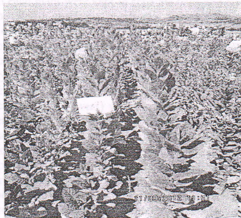
Fig2. (Plot 170)