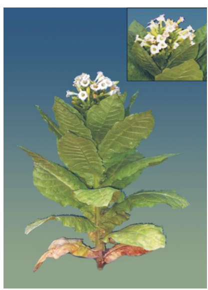
Ph. 3. Prilep P 10-3/2