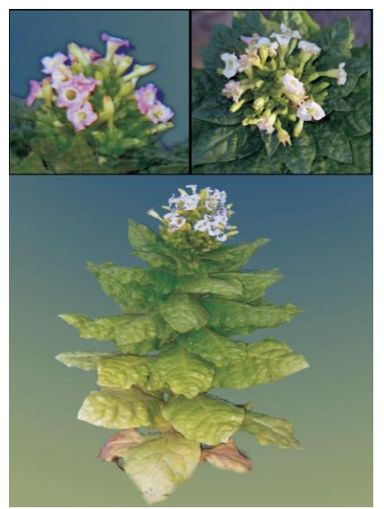
Ph. 1. Prilep P23

Mode of inheritance of investigated biological traits is evaluated on the basis of test - significance of the mean values of F1 progeny compared to parental average (Boroevic, 1981).