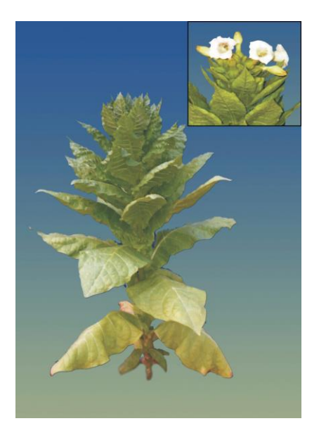
Ph. 4. Prilep P 76/86