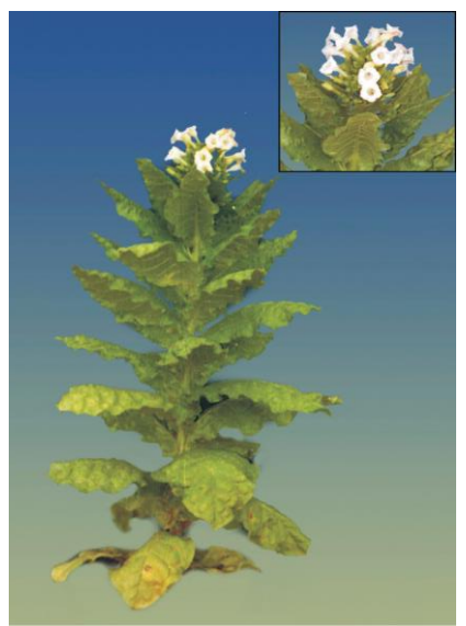
Ph. 2. Prilep P-84