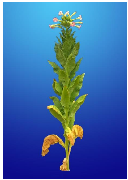
Ph. 6. Yaka YV 125/3