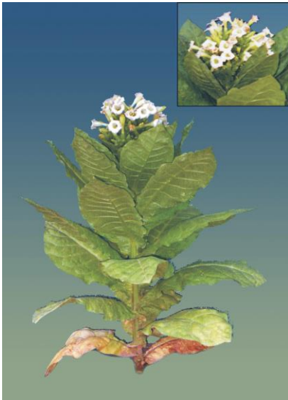
Ph. 3. Prilep P 10-3/2