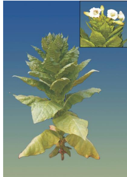
Ph. 4. Prilep P 76/86