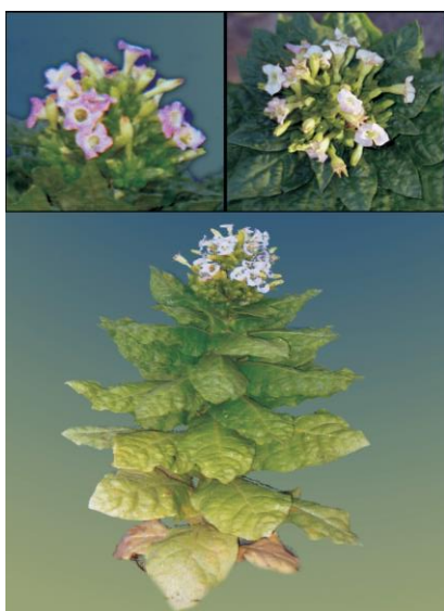
Ph. 1. Prilep P23

Mode of inheritance of investigated biological traits is evaluated on the basis of test - significance of the mean values of F1 progeny compared to parental average (Borojevic, 1981).