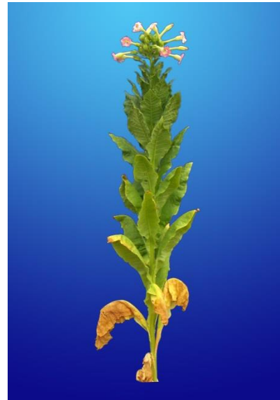
Ph. 6. Yaka YV 125/3