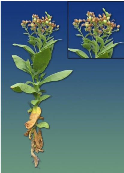
Ph. 5. Xanthi Djebel XDj-1