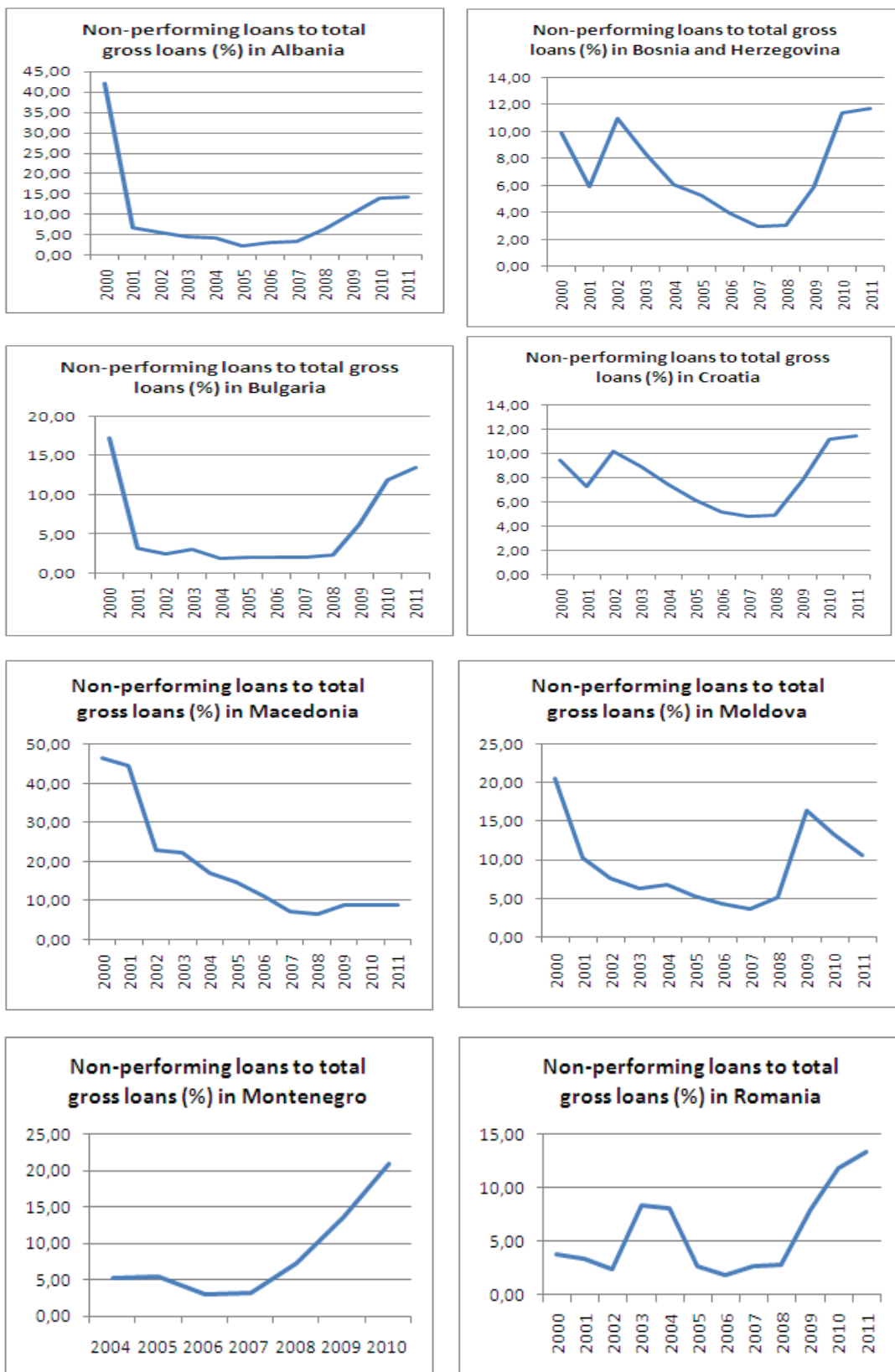
Fig. 1a. Non-performing loans to total loans in Southeastern European banking systems