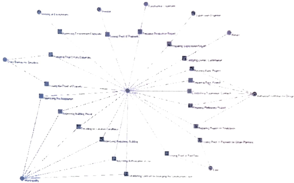
Figure 2: Integrated document-flow network corresponding to four different services in the domain of urbanism.

To avoid verbosity, I do not include the graphs of individual document-flow networks corresponding to simple services. Instead, I aggregated them together in a single document-flow network depicted in Figure 2. It integrates data about document flow in all four urbanism-related services in Macedonia.