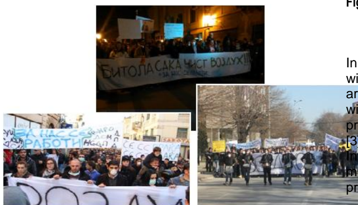
Figure 4. The atmosphere of the public protests

The paroles of the protests were deeply significant: "We want to breed", "Take off the gas-masks", "Air is a life, air is a right", "Bitola on gills" (Fig. 4). Several demands had been delivered from NGO "It's all about us" to local authorities: urgent placement of monitoring system in central area of the town; air pollution reduction and system of penalties for biggest air polluters; maintenance of air quality according to permissible limits.