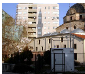
Figure 2. Monitoring station Bitola 2

The usual obstacles for systematic monitoring of the pollutants, especially of the particles (PM 10 и PM 2.5 ), and for the network creation are working/maintenance cost and cost for repair of the instruments, as well as the shortage of qualified personnel.