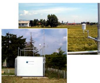
Figure 1. Monitoring station Bitola 1

Bitola is such a town without monitoring network. There are only two monitoring stations: Bitola 1 is located in the town's periphery, at 13 km distance from the previously mentioned plant; Bitola 2 is in the town's centre, in public organization's courtyard. Bitola 2 is very often out of order. Both stations measure: O 3 , NO 2 , SO 2 , CO и PM 10 . The stations aren't mutually connected. Results from Bitola 1 are used in the reports of Ministry of environment, health organizations, NGO and others.