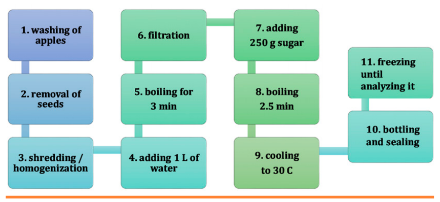
Figure 1Steps for apple juice preparation

Extraction of chlorpyrifos pesticide residues was performed using the QuEChERS method according to the standard MKS EN 15662:2018 LC-MS/ MS. The QuEChERS method involves liquid extraction of pesticide residues from fruits using a solvent acetonitrile (Anastassiades et al., 2003; Bruzzoniti et al., 2014). This method consists of using gas or liquid chromatography (Standardization Institute of the Republic of Macedonia, 2011). The procedure for extracting residues was as follows: 10 ±0.1 g homogenized fruit sample was weighed in a tube of 50 mL, then was added 10 mL acetonitrile and the sample was extracted with ultra turax for 2 min at 4,000 rpm. Then a mixture of 4 g of magnesium sulfate anhydride (MgSO), 1 g sodium chloride, 1 g trisodium citrate dihydrate and 0.5 g disodium hydrogen citrate hexahydrate were added to the extract. The sample