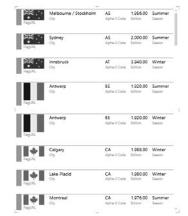
Figure 5 - Card visualization in Power BI