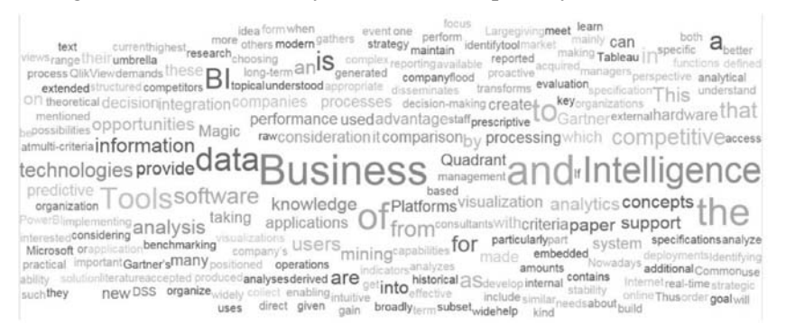
Figure 3 – Word cloud visualization created in Tableau

Tableau and QlikView both offer the ability to do statistical analysis and forecasting, while Power BI has yet to add this capability.