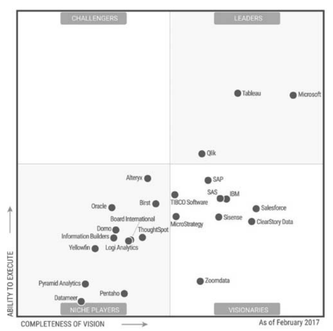
Figure 1 – Gartner's Magic Quadrant for BI platforms [9]

As defined by Gartner, BI platforms perform, to wide range of users, from IT staff to consultants and business users, to build applications that help organizations learn about and understand their business. Taking into consideration criteria of evaluation of BI software tools, the additional analysis is made in this paper, considering business criteria as data integration possibilities of mentioned tools, hardware specification, comparison of used technologies and tools for data visualization.