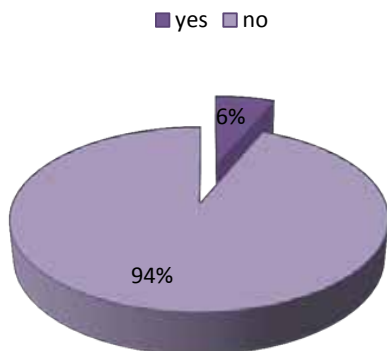
Figure 2. Do the firms think about capital mobilization through securities issuing

On the last question, “Do you think about capital mobilization through securities issuing?”, only 6.25% of the firms, i.e. only 3 firms, said that they think about resources mobilization through capital market (Figure 2).